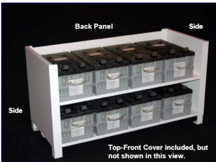
BR88D-BP With Back Cover