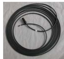
30 Ft cable